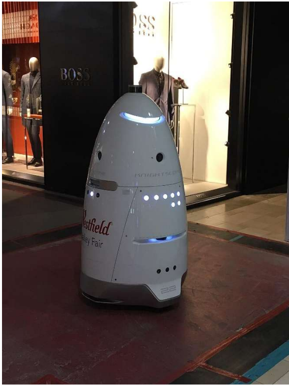
Figure 1 - The Knightscope K5. Streaks along at 3 MPH.

they no longer call it that: it's Holtville now. The original name came from a local store owner who would say, "We're slap out!" if it wasn't in stock. This obviously happened often enough to become locally famous.