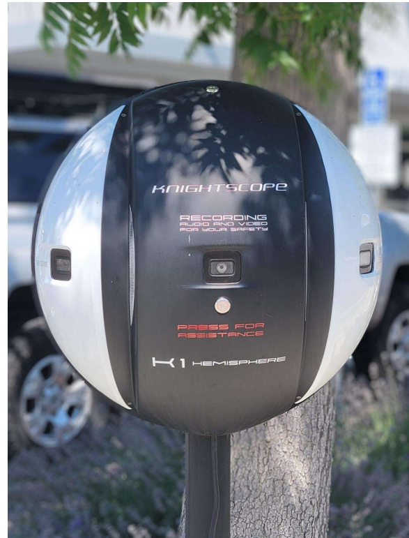
Figure 2 - I ain't got feets, so I go 0 MPH!

But I had fun looking into this one: Knightscope is based in Mountain View, CA and makes security robots with – of course – Artificial Intelligence capabilities. The K5 mobile units remind me of Daleks from the classic Doctor Who series (Figure 1). Google returns page after page of promotional stuff from the company about how these 300-400 pound things are revolutionary and totally worth the thousands of dollars in monthly lease fees. They use a subscription-type plan for their products (including the fixed mount K1, Figure 2).