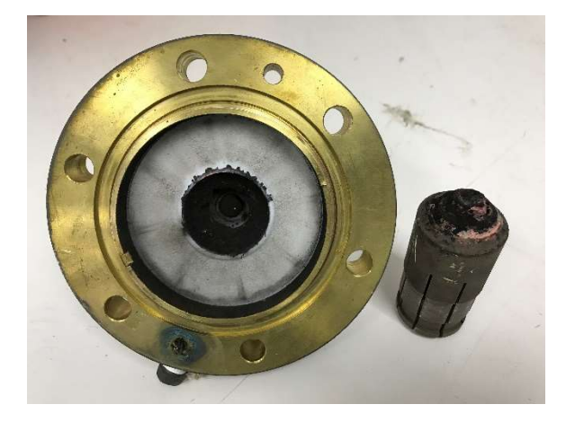
The damaged end terminal adaptor -- note that the stud on the back of the bullet has been vaporized.

When this kind of thing happens, we tend to assume it is tower #2, since it has the smallest line of all the towers in the daytime system and this is where we have had several issues in the past. We looked in the building in the phasor as well as the ATUs at the towers but didn't see anything obvious. Not what we had hoped. Of course, I think we can all agree that