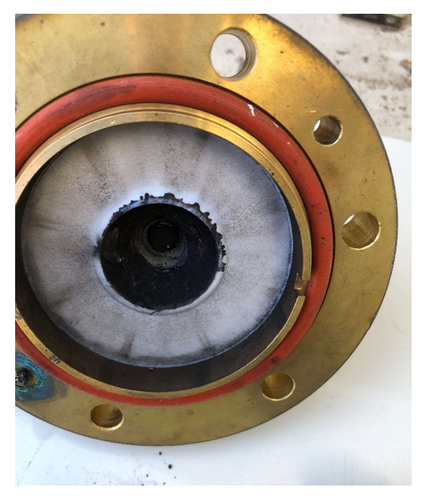
Burned out end terminal adaptor from KLTT tower #1. Note that the Teflon does not show signs of arc-over.

I don't really have a good explanation for this failure, and I don't think it was related to the power issue that had occurred the prior two evenings. Thankfully, we had a spare end terminal adaptor on