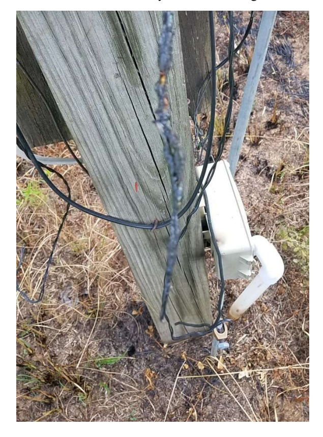
Figure 1 - Lightning did a bit of damage to WXJC-FM's phone line in July.

of the severe storms in July. AT&T has long since