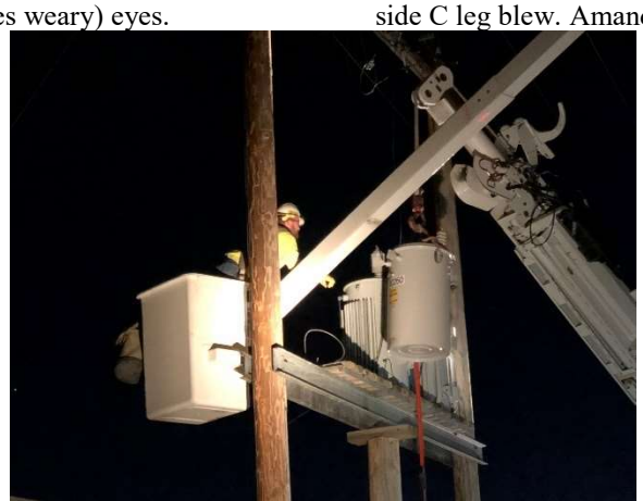
United Power replaces a 100 kVA transformer at the KLTT site.

Many in our company and throughout the broadcast industry were thinking about our friends at Wheatstone in New Bern, which was pretty much "ground zero" for the storm. Thankfully, the plant and everyone who works there reportedly came through uninjured, but some had damage to their homes. Many were actually in Amsterdam during the storm, probably wondering about their homes and loved ones back in North Carolina. The Scriptures say that the