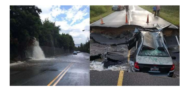
Figure 2 - Two different pictures, but they show what can happen. Turn around!

method: when power is first applied, a small relay charges the supply through some resistors to limit inrush current. Once the supply reaches a certain level, a large relay kicks in, bypassing the resistors and placing the AC line directly on the input. I'm sure most engineers are familiar with this; if you've been doing this for any time at all, you've doubtless seen this.