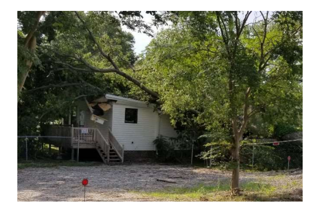
Figure 1 - Strong winds destroyed this beauty salon near Warrior, AL, where Sandy and I live.

things to go wrong. When you lose your antenna monitor, even if only briefly, you already know what to do: you confirm that you are in parameters by other means, including some field strength measurements.