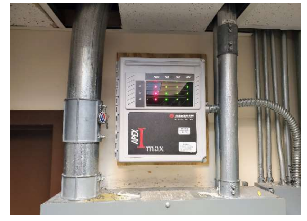
Whole-site SASD surge protectors are employed at each site.

the other pairs, this cable is copper clad on the entire inside of the cable jacket. This cabling is bonded to the tower in several spots. We haven't replaced every outside cable with the copper clad CAT6 cable, but we seem to have done enough of them to make a big difference. The cable is not cheap, but then again, neither are tower crews.